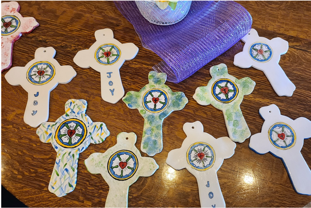
And the finished crosses!

Some of these crosses will find their way to new members hands and for other celebrations of life together as church!