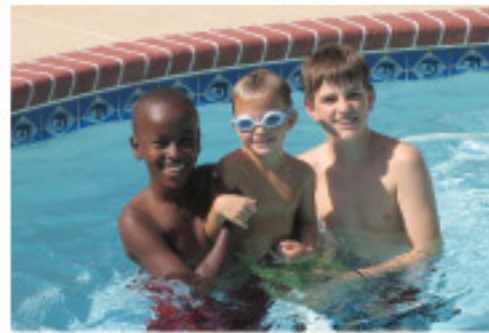
"Jambo" means "Hello!"

"From God we hear the word: If you want my goodness to stay with you then serve your neighbor, for that is where God comes to you." -Dietrich Bonhoeffer